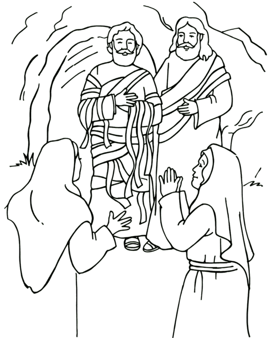
Jesus Raises Lazarus