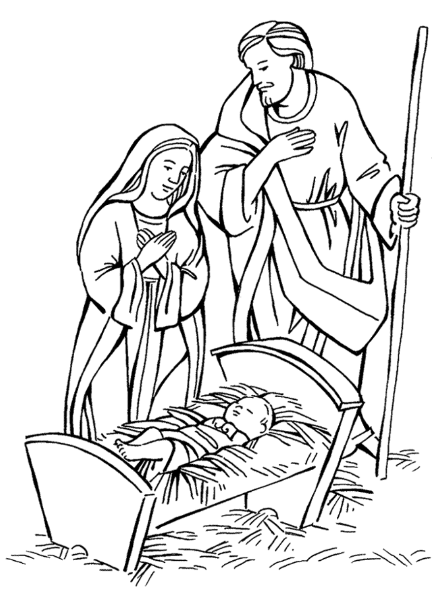
The Word became flesh and made his dwelling among us. John 1:14