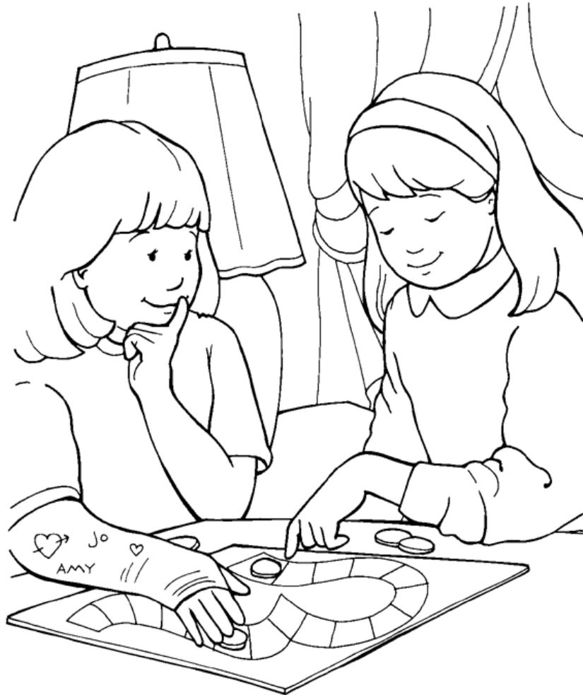
Showing Kindness Toward Others

From Thru-the-Bible Coloring Pages for Ages 4-8. Standard Publishing. Used by permission. Reproducible Coloring Books may be purchased from Standard Publishing, www.standardpub.com , 1-800-543-1301.