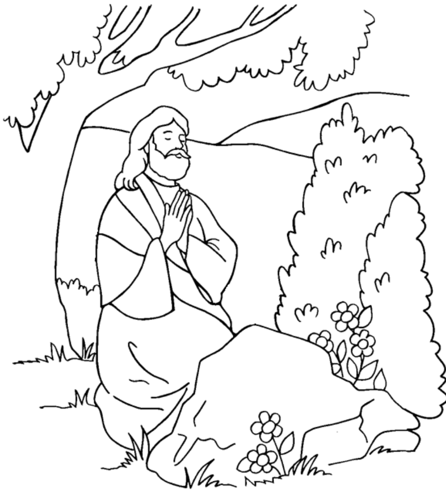
Jesus Prays for His Disciples