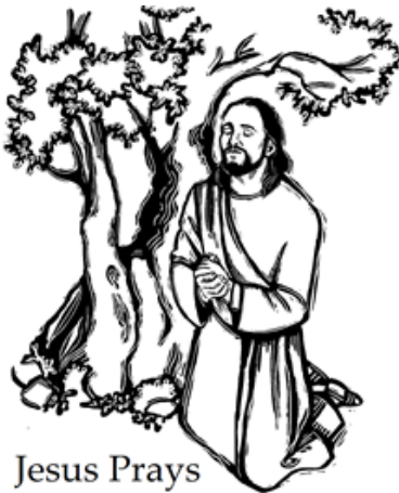
Jesus Prays for his disciples.

Copyright © Sermons4Kids, Inc. May be reproduced for Ministry Use