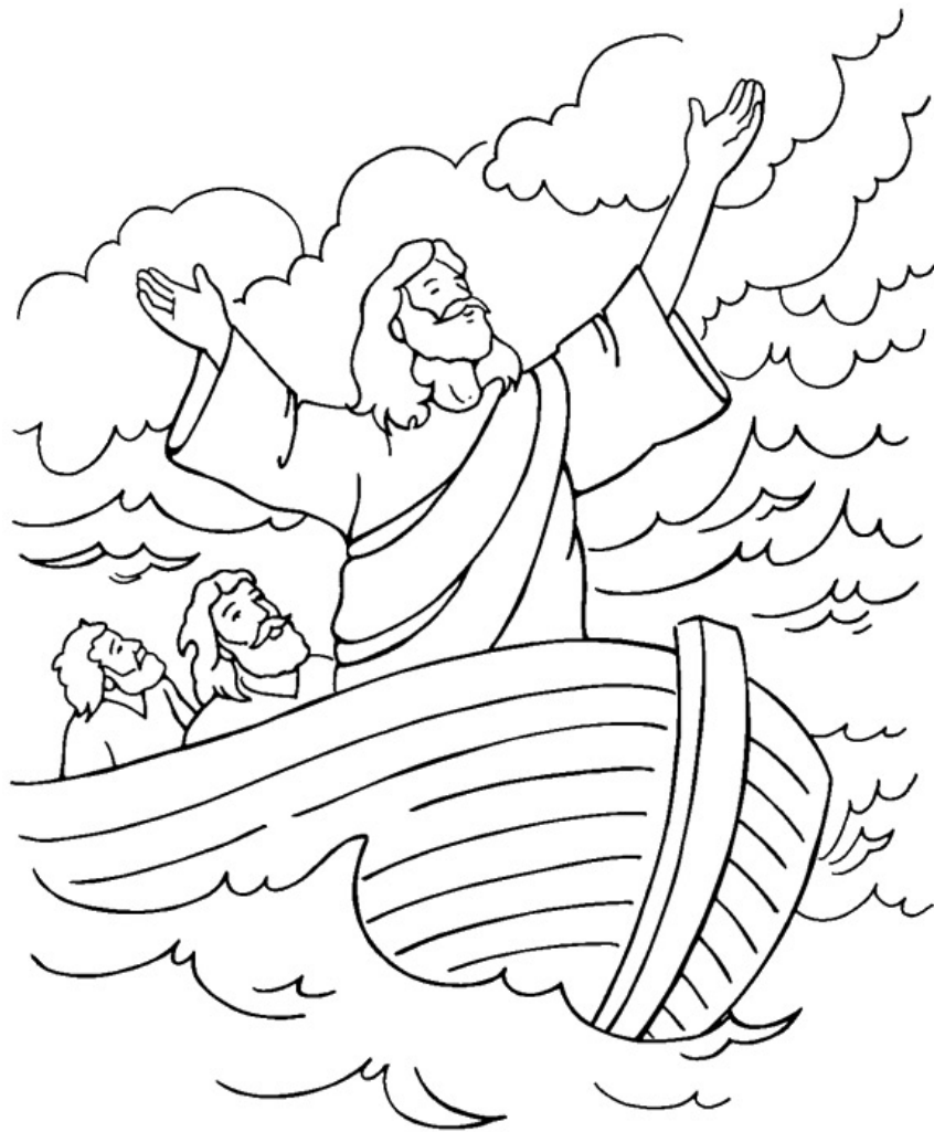
Jesus Calms the Storm

From Thru-the-Bible Coloring Pages for Ages 4-8. © Standard Publishing. Used by permission. Reproducible Coloring Books may be purchased from Standard Publishing, www.standardpub.com, 1-800-543-1301.