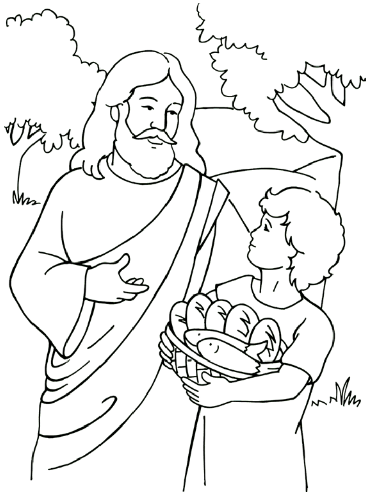
Jesus Feeds 5,000

From Thru-the-Bible Coloring Pages for Ages 4-8. © Standard Publishing. Used by permission. Reproducible Coloring Books may be purchased from Standard Publishing, www.standardpub.com .