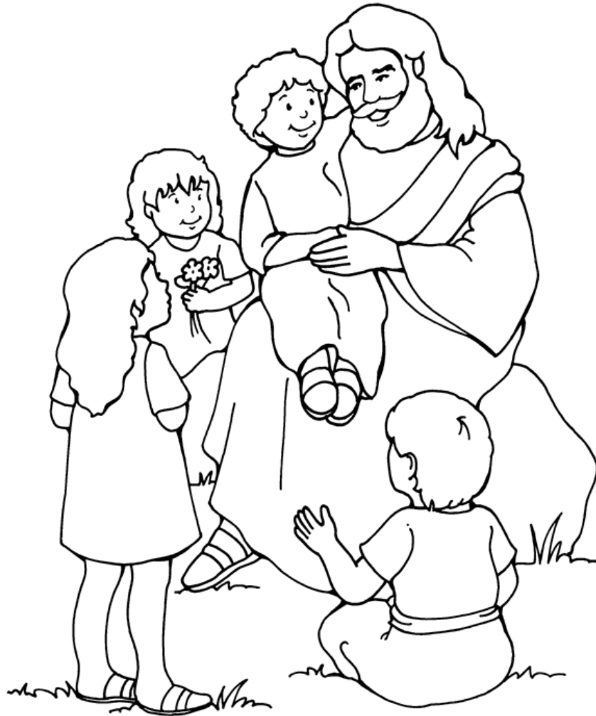
Jesus and the Children

From Thru-the-Bible Coloring Pages © 1986, 1988 Standard Publishing. Used by permission. Reproducible Coloring Books may be purchased from Standard Publishing, www.standardpub.com , 1-800-323-7543.