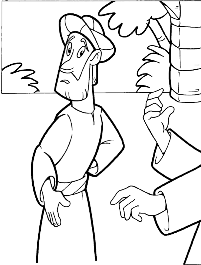
THE RICH YOUNG RULER Mark 10:17-31