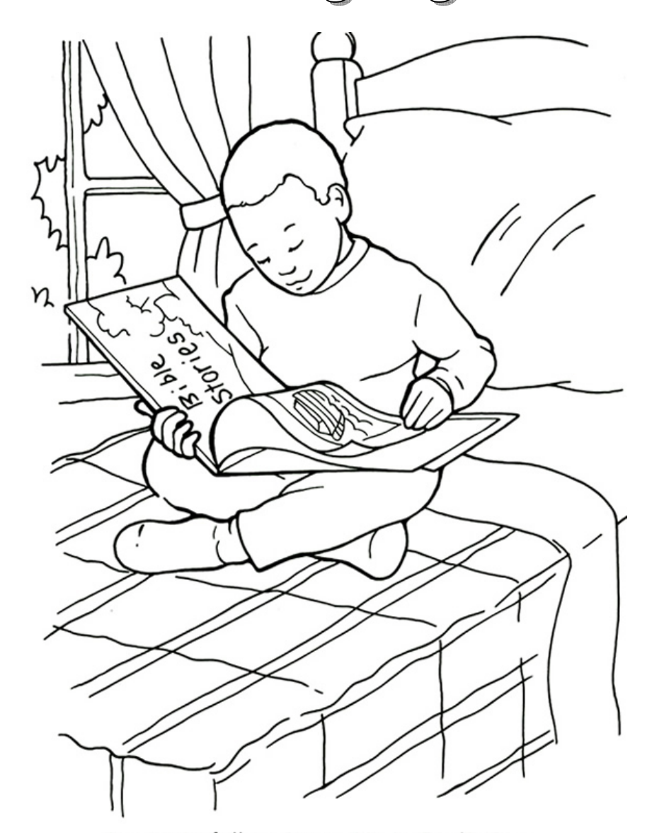
I want to follow Jesus. He is God's Son.

From Thru-the-Bible Coloring Pages for Ages 4-8. © 1988 Standard Publishing. Used by permission. Reproducible Coloring Books may be purchased from Standard Publishing, www.standardpub.com, 1-800-543-1301.