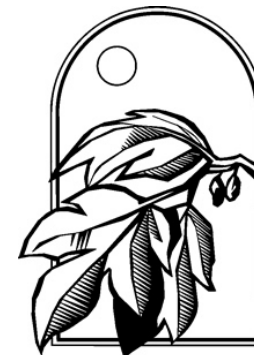
Parable of the Fig Tree Luke 13:1-9