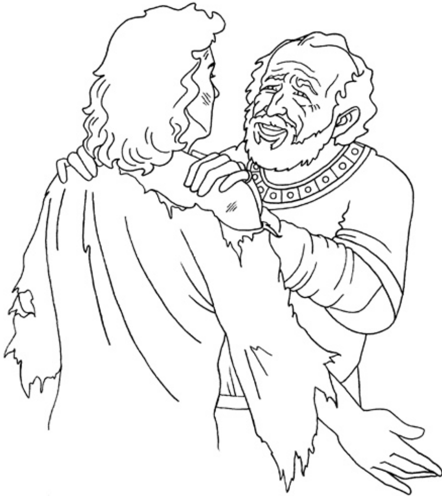
Jesus told the parable of the prodigal son. Luke 15:11-32