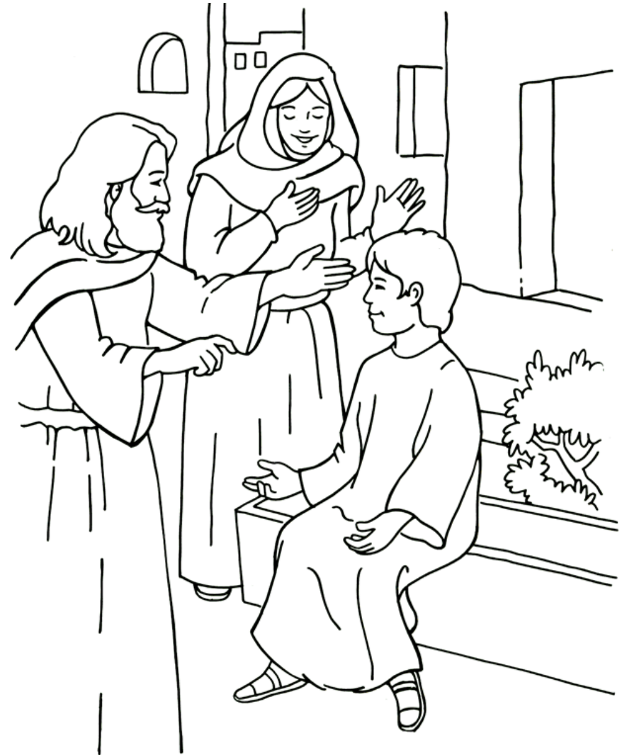
Jesus Raises a Young Man to Life